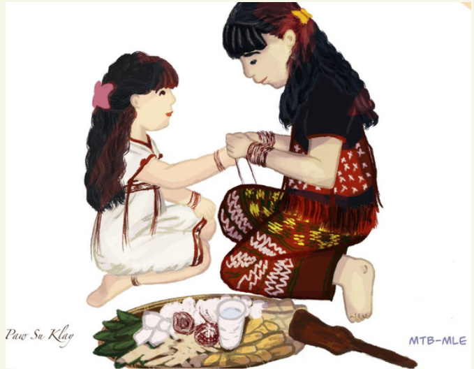
Paw Su Klay

"ပြုကလဟဲကဟဲကဟဲ,ဟဲကဟဲအိၣ်လဟဲဟဲ, အိၣ်လဟဲသ့ၣ်ခိၣ်တဂ့ၤ, အိၣ်လဟဲလဲထံးတဂ့ၤ, အိၣ်လဟဲမ့ၣ်ခိၣ်သိၣ်လဲတဂ့ၤ, ဟဲကဟဲအိၣ်ဒီးမိပါ, ဟဲကဟဲအိၣ်ဒီးဖဲဖု, ဟဲကဟဲအိၣ်ဒီးနီၣ်ကစၢ်တုၤခိၣ်ဝါဒိလုၣ်အထံးတက့ၢ်"